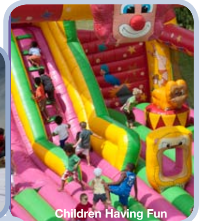
Children Having Fun