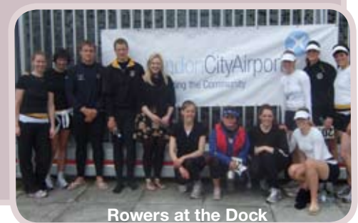
Rowers at the Dock

The Poplar Rowing Regatta and its 1400 participants came to the Royal Docks to host its annual one day event with sponsorship from LCA in June. The Regatta has been running at the docks since 1984 and is becoming one of the most popular events in Rowing Clubs' diaries across the country. The event is run by Poplar, Blackwall and District Rowing Club based in Ferry Street, Isle of Dogs, which was formed in 1845 and is believed to be the third oldest rowing club in Great Britain. LCA has supported the Club since 2007 and the event sponsorship is part of the Airport's health and wellbeing for work programme.