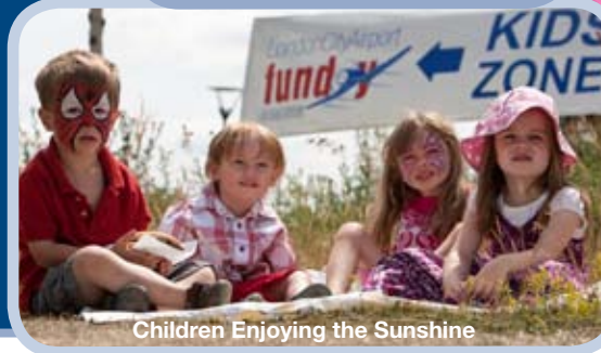
Children Enjoying the Sunshine