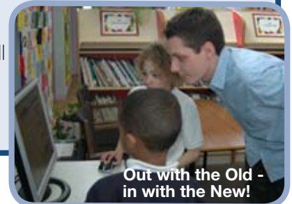
Out with the Old - in with the New!

Staff and pupils at Scott Wilkie Primary School in Custom House are enjoying a new computer and books for the school's recently developed library courtesy of LCA and on-site partner, WHSmith. The computer, specifically designed for schools, was purchased by the Airport and sits in pride of place in the student's library area. The computer will be used for a child-managed book loan system, allowing pupils to borrow books from the library for personal use as well as encouraging the use of ICT at the school. WHSmith also kindly donated new books for the library.