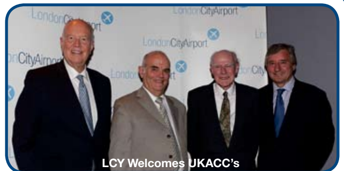
LCY Welcomes UKACC's

Later, after dinner at Forman's restaurant, the delegates were addressed by Jim Fitzpatrick MP the Labour MP for Poplar and Limehouse (the constituency adjoining LCA), a former Minister for Aviation.