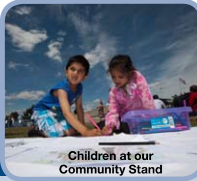
Children at our Community Stand

Please make a note in your diary for next year's Fun Day which will take place on Saturday 2 July 2011.