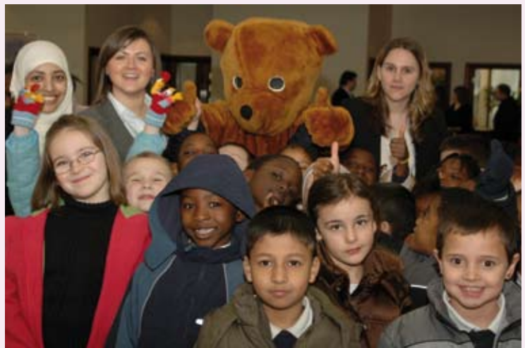
It's a thumbs up from Barnaby!

Barnaby and London City Airport volunteers have been busy teaching local school children about London as a tourist attraction. Following a classroom based session, children greet Barnaby when he flies home from his London trip to Manchester, from London City Airport. Barnaby is currently looking forward to July when students from Drew and Scott Wilkie Primary Schools are due to pay him a visit.